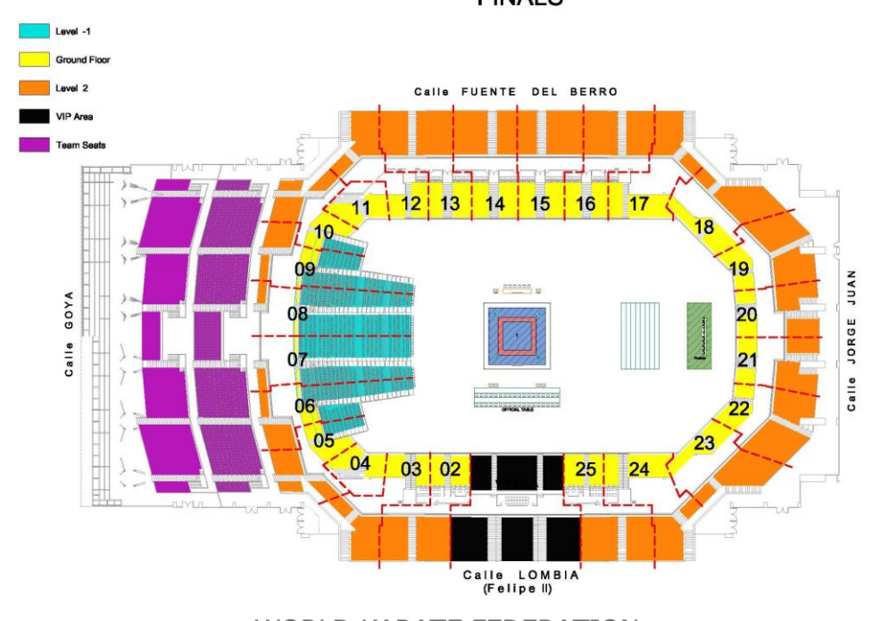
WORLD KARATE FEDERATION